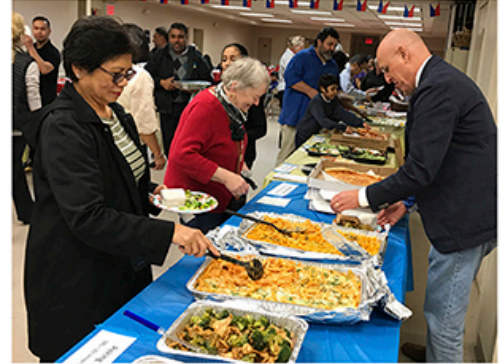
One of several food tables from local merchants