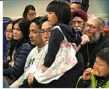
Folks enjoying the performance