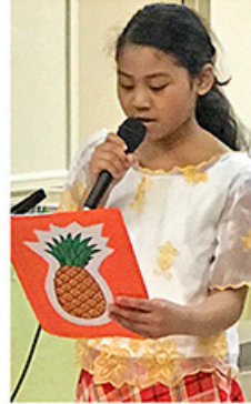
Reading a folk story